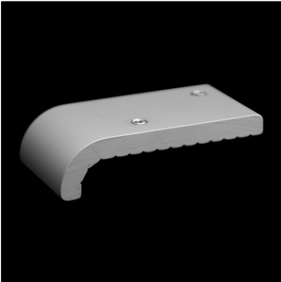
shown in Clear Anodize

This product is not intended for use on steps, stairs, sidewalk curb, or any pedestrian trafficked surfaces.