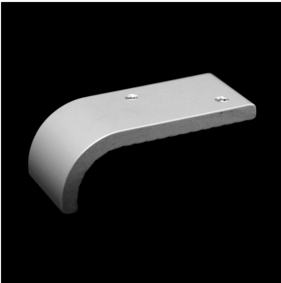
(shown in Clear Anodize)

Description: This part is designed for walls with a 1" radius edge. Model FR 1.0 is commonly used on 2" bullnose brick and poured concrete with 1" radius edge. This part uses two SMART PINS PLUS anchors.