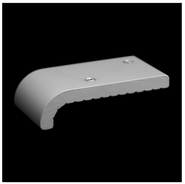
shown in Clear Anodize

This product is not intended for use on steps, stairs, sidewalk curb, or any pedestrian trafficked services.