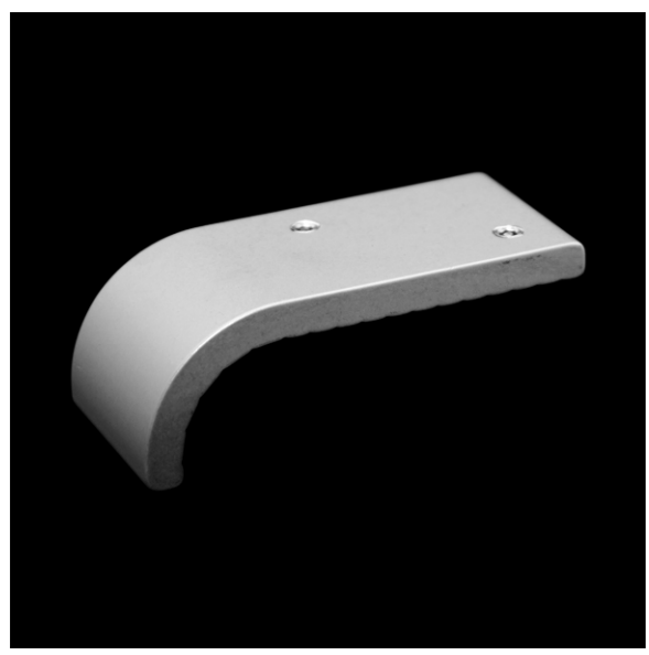
(shown in Clear Anodize)

Description: This part is designed for walls with a 1" radius edge. Model FR 1.0 is commonly used on 2" bullnose brick and poured concrete with 1" radius edge. This part uses two SMART PINS PLUS anchors.